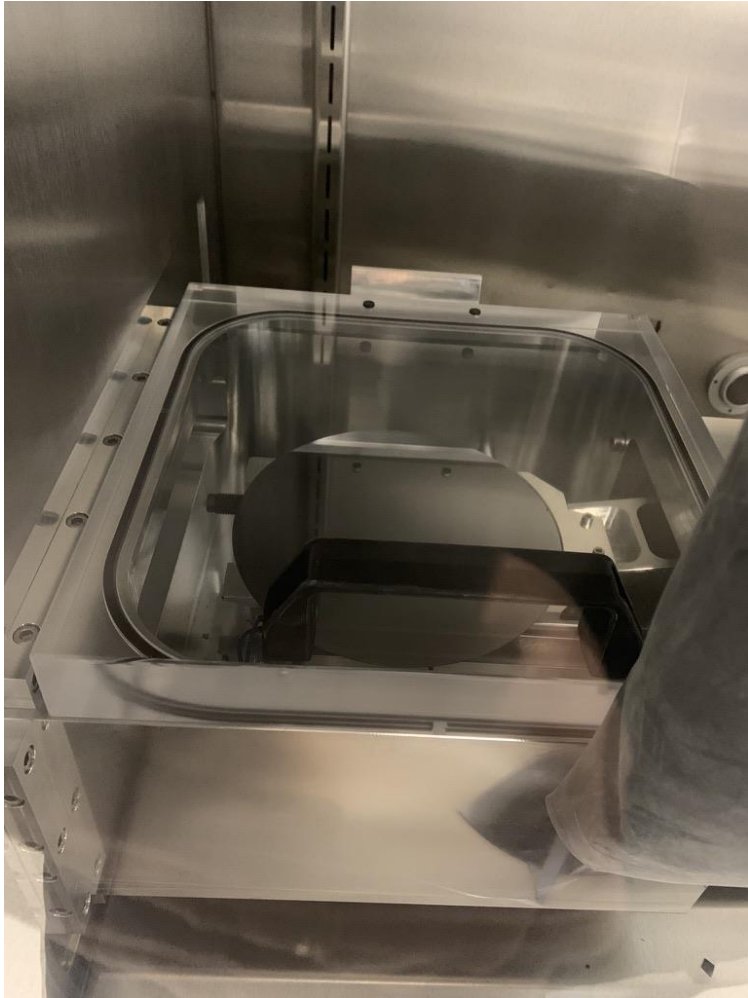
loading chamber inside of glovebox